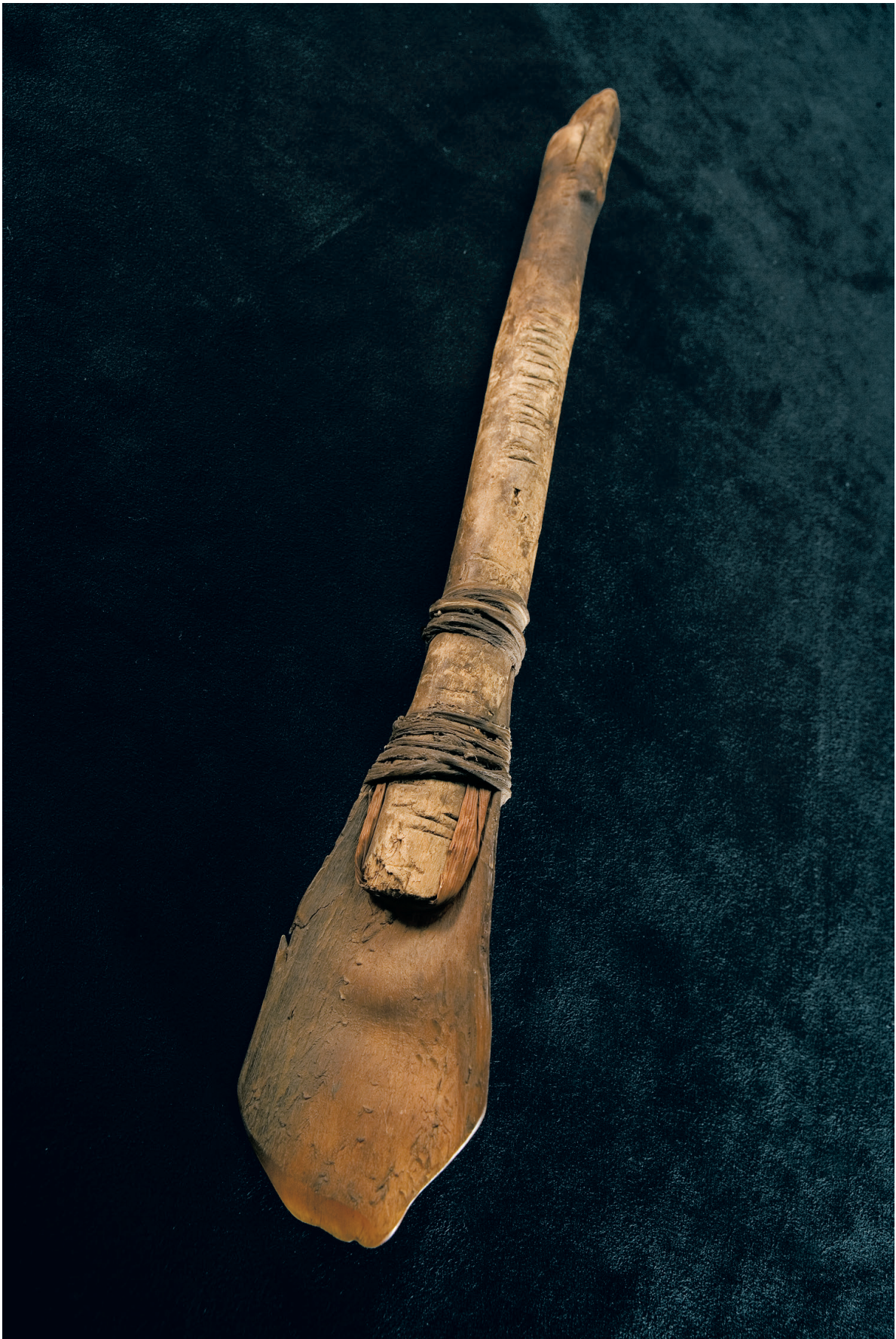
Hoe, Kayenta Branch Puebloan. Courtesy of Natural History Museum of Utah (UMNH), CM.49395