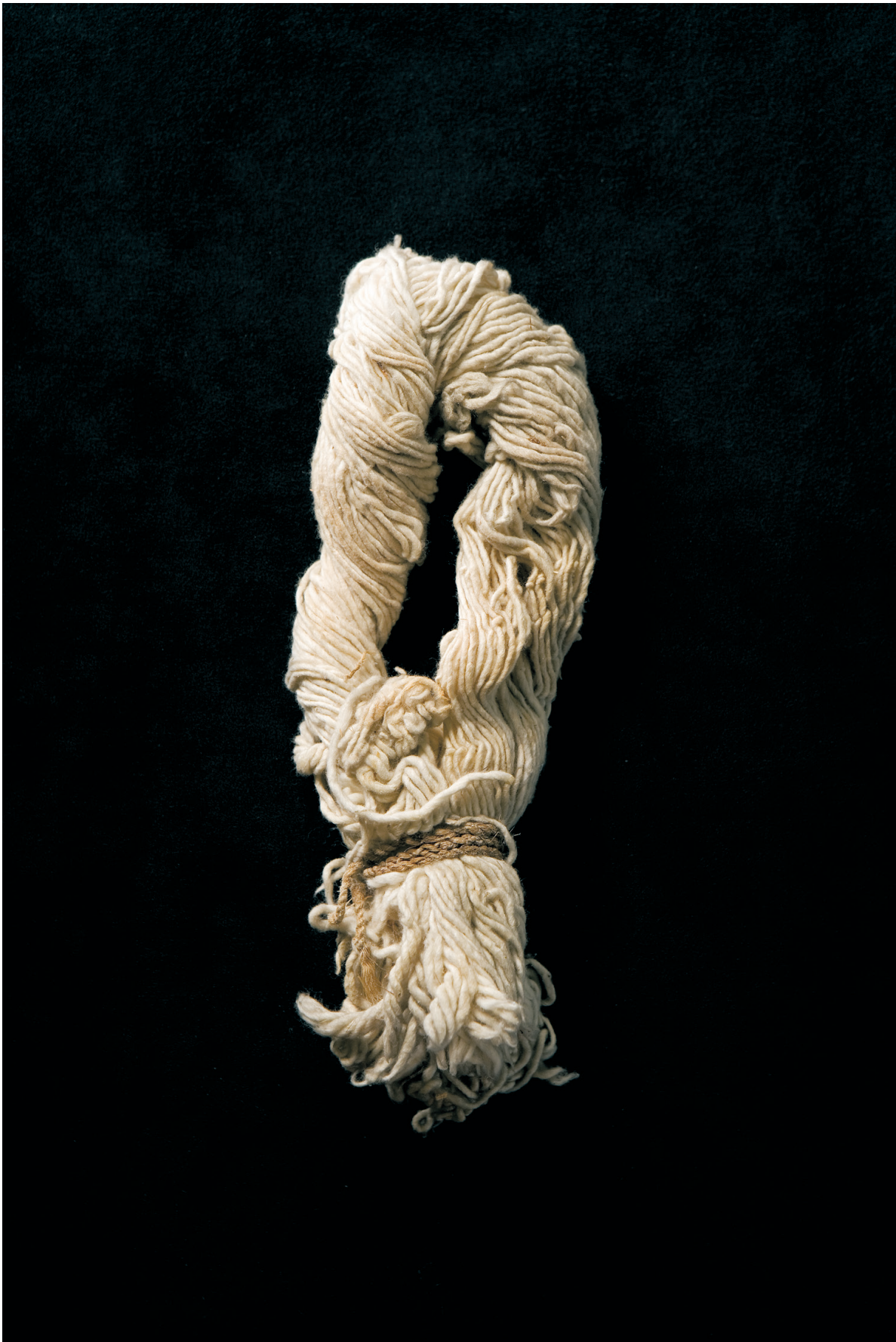
Cotton skein, San Juan Branch Puebloan. Courtesy of Natural History Museum of Utah (UMNH), CM.89272