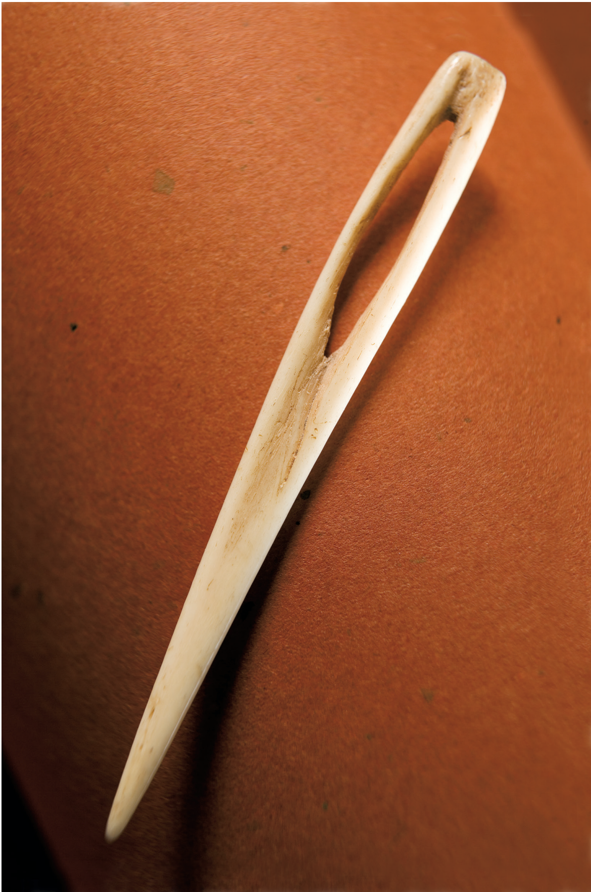
Bone needle., Fremont. Courtesy of Natural History Museum of Utah (UMNH), CM.98145