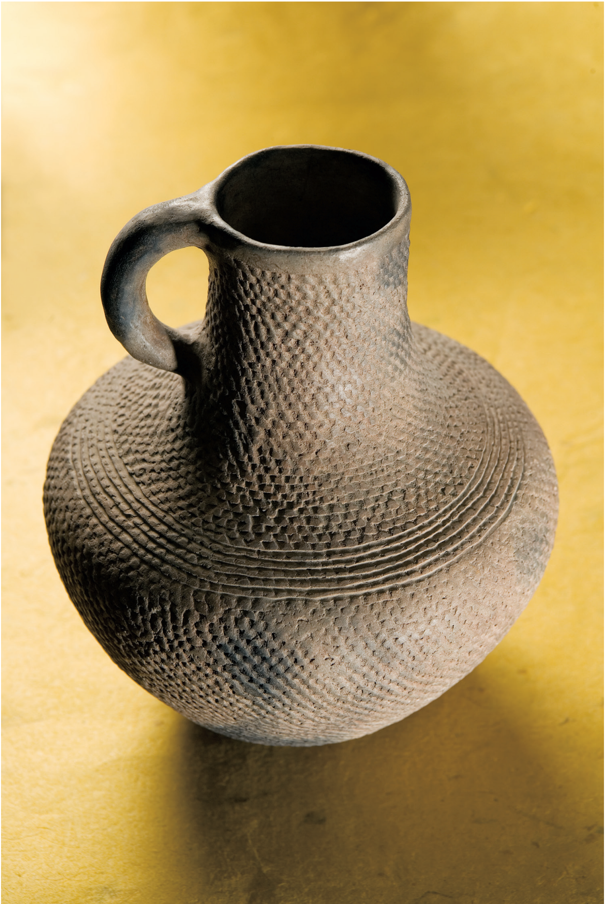
Corrugated pitcher, Fremont. Courtesy of Natural History Museum of Utah (UMNH), CM.54809