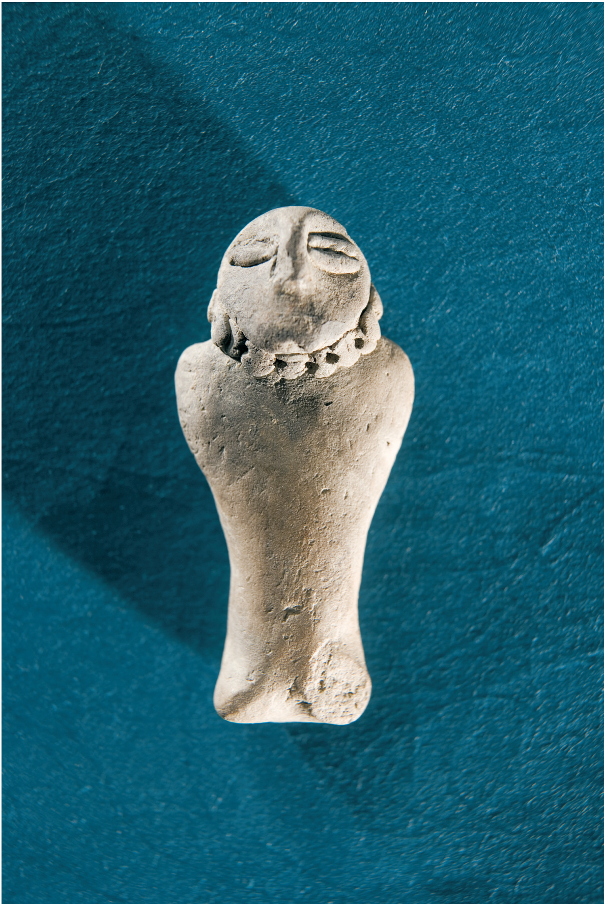
Unfired clay figurine, Fremont. Courtesy of Natural History Museum of Utah (UMNH), CM.79568