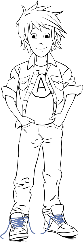
AUGUSTIN THE ARCHAEOLOGIST