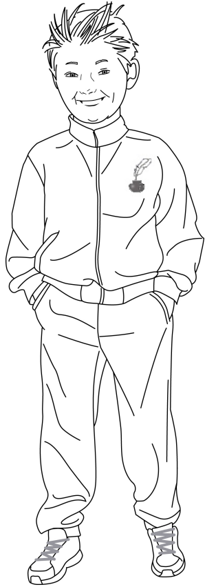
OCTAVE THE POET